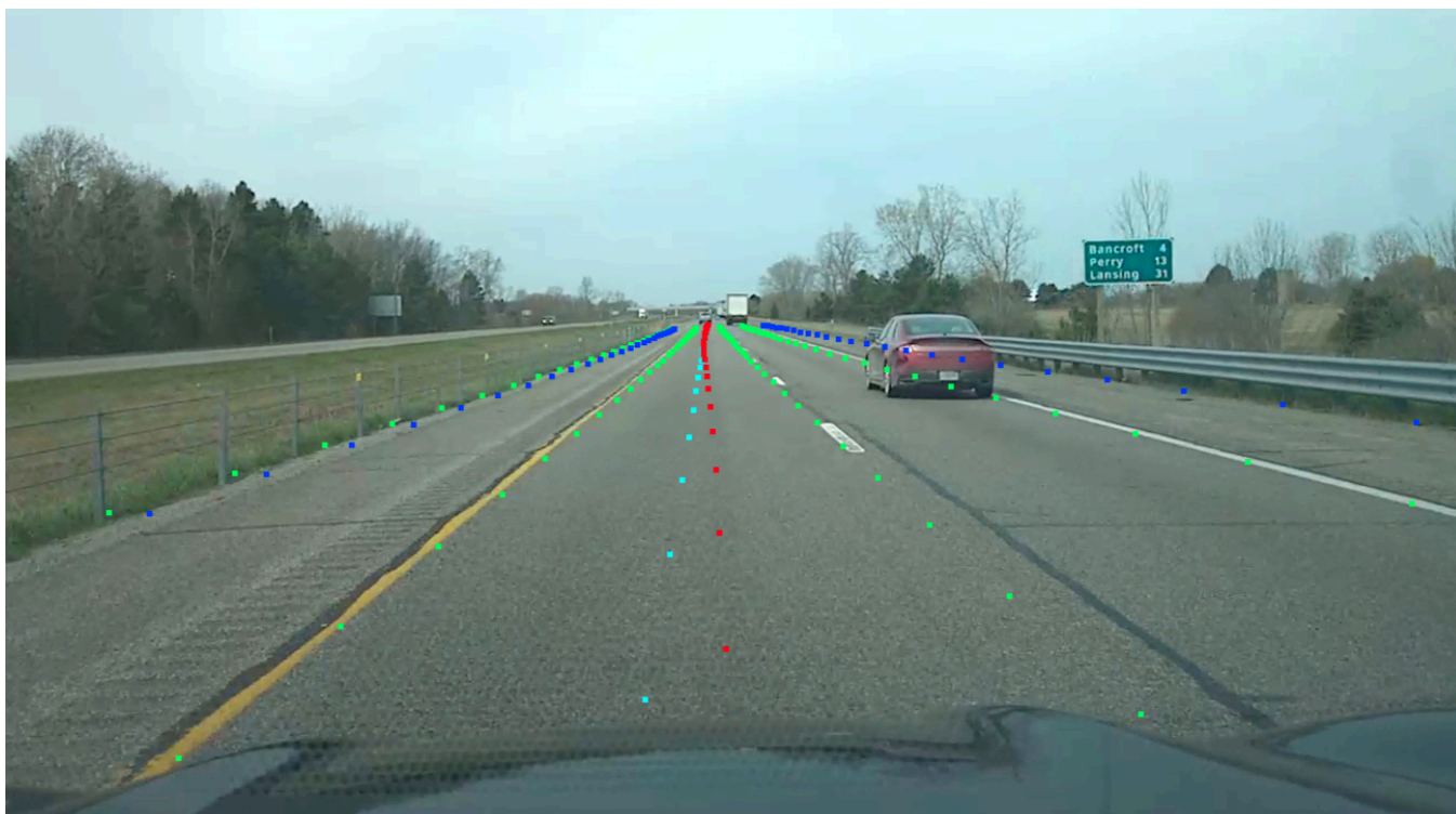
Lane centering reference design featuring OpenPilot AI Model running on Nvidia Orin