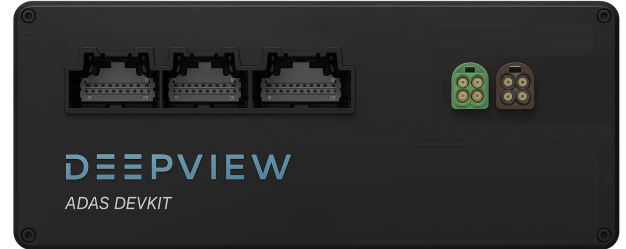
AI Vehicle Computer featuring Nvidia Orin AGX

The AI Vehicle Computer is a Drive-by-Wire developer kit for automakers building on Nvidia Drive hardware. Included software reference design features the OpenPilot AI Model for lane centering, validated on 100 million miles of driving data and featuring the world record for fastest semi-autonomous coast-to-coast drive. Tech specs include up to 8 GMSL2 cameras, forward Radar or Lidar, 2 CAN-FD interfaces, and real-time AI inference. Featuring built-in data recording and LTE connection, all data is logged and sync'd with customer datacenter to facilitate Fleet Learning. The AI Vehicle Computer is installable on Ford vehicles and can be adapted to additional manufacturer's upon request.