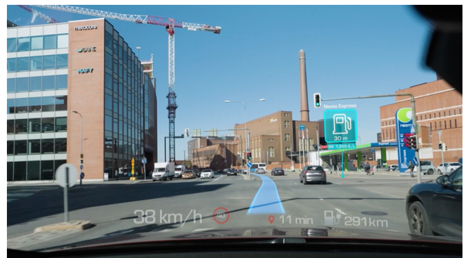
Lane Centering heads-up-display (Artist Concept)

Leverage Deepview engineering expertise writing production software for Nvidia hardware to accelerate your time to market. Our Resident Engineers sit on-site at your facility and work with your team to solve your most challenging advance engineering and R&D opportunities. Our Resident Engineers have expertise in AI Training, AI Inference, Data Logging, Datacenter Sync, Over-the-air updates, and real-time software. Additional technical resources are available in ECU Programming, Device Driver development, and Functional Safety.